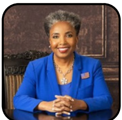
Dr. Carol Swain

Author, Speaker, Professor & Political Scientist