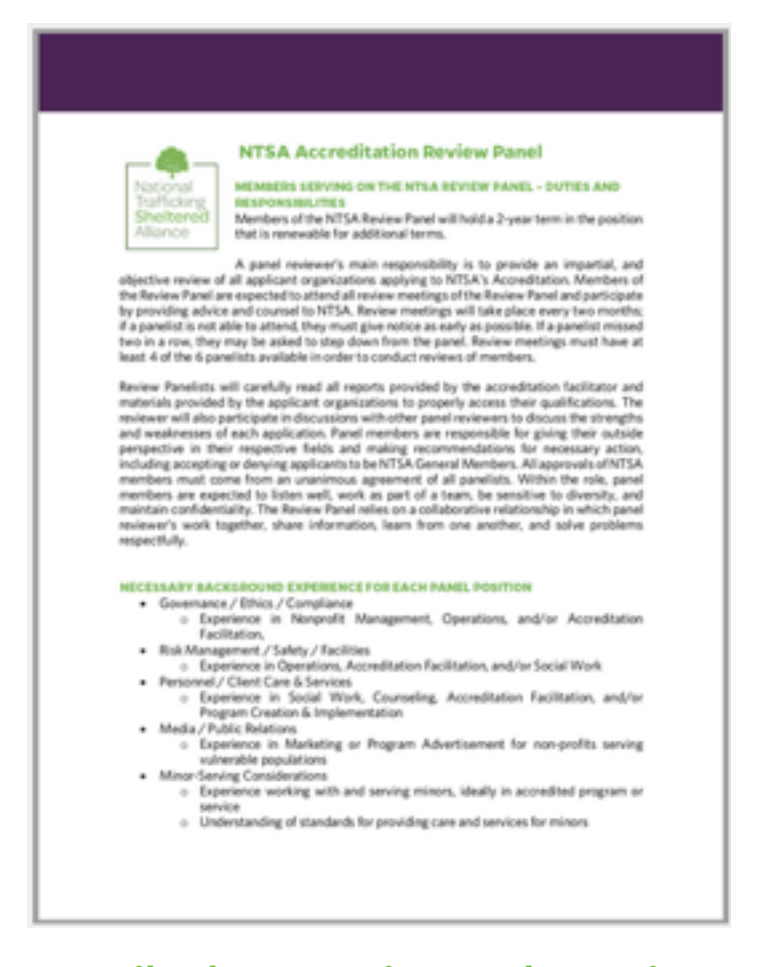
Details about serving on the Review Panel

We will be accepting nominations until November 30th!