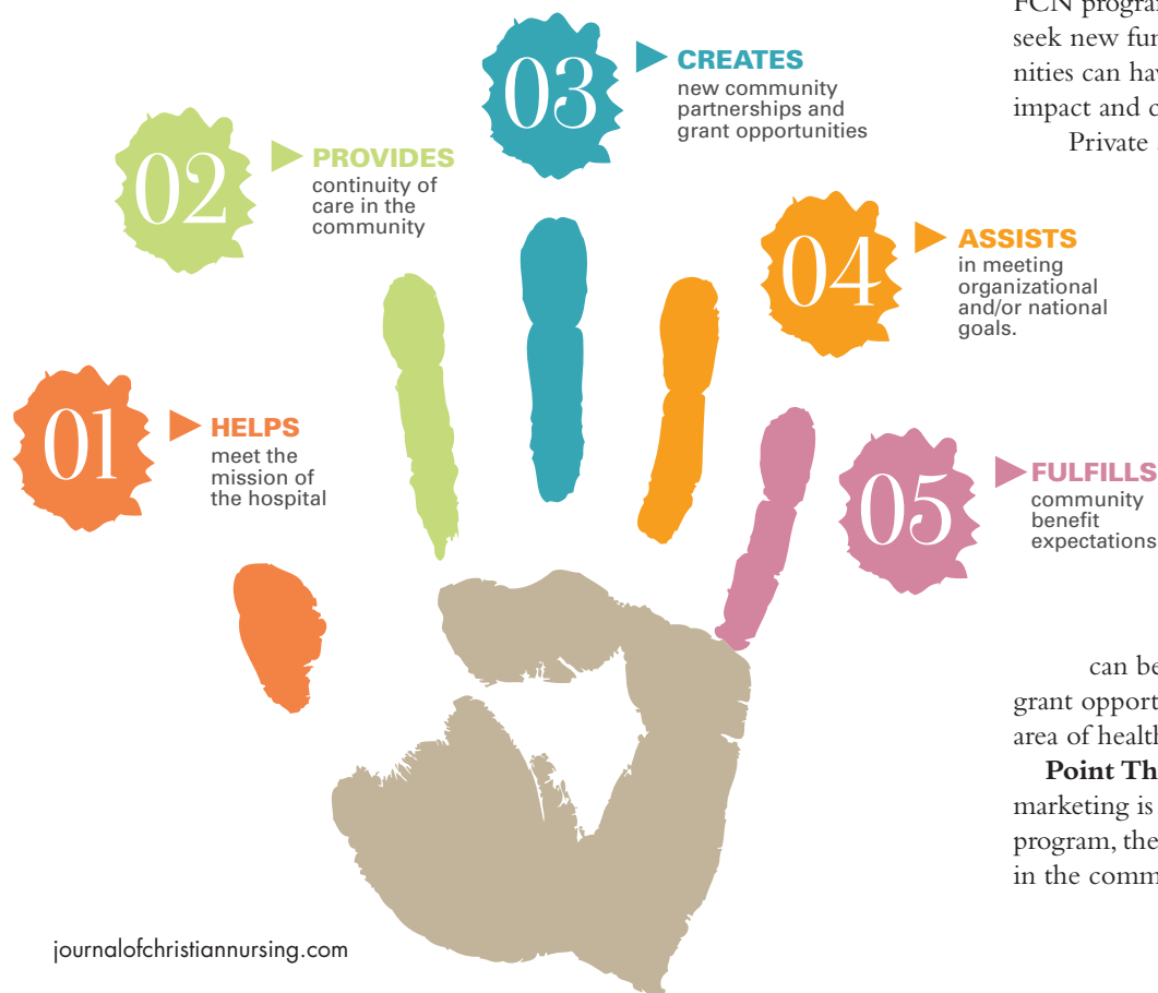
Figure 1. Five-Finger Illustration: Faith Community Nurse Program Value (Ziebarth, 2015)

Point Three: Marketing Although marketing is not the focus of an FCN program, the hospital's good name is in the community. The FCN becomes